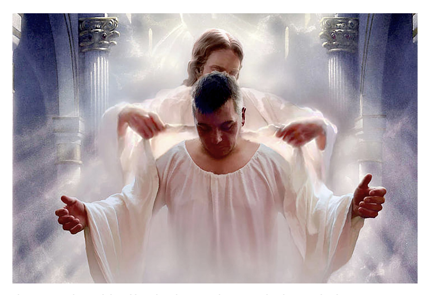
The way we understand the Bible and its themes, such as imputed and imparted righteousness, is determined by the law lens through which we view them. What is the reality?