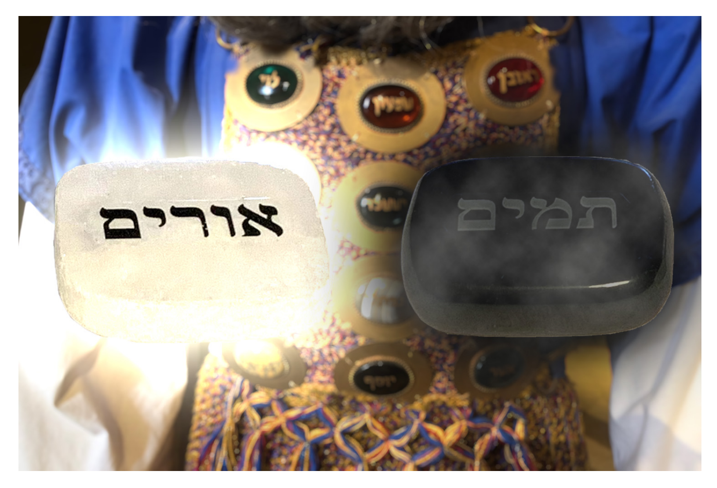
"The sanctuary was designated as the place of divine judgment as indicated by the judgment of Urim (Num. 27:21) and by the breastplate of judgment of the high priest..." When you read descriptions like this, what comes to mind? Something legal?