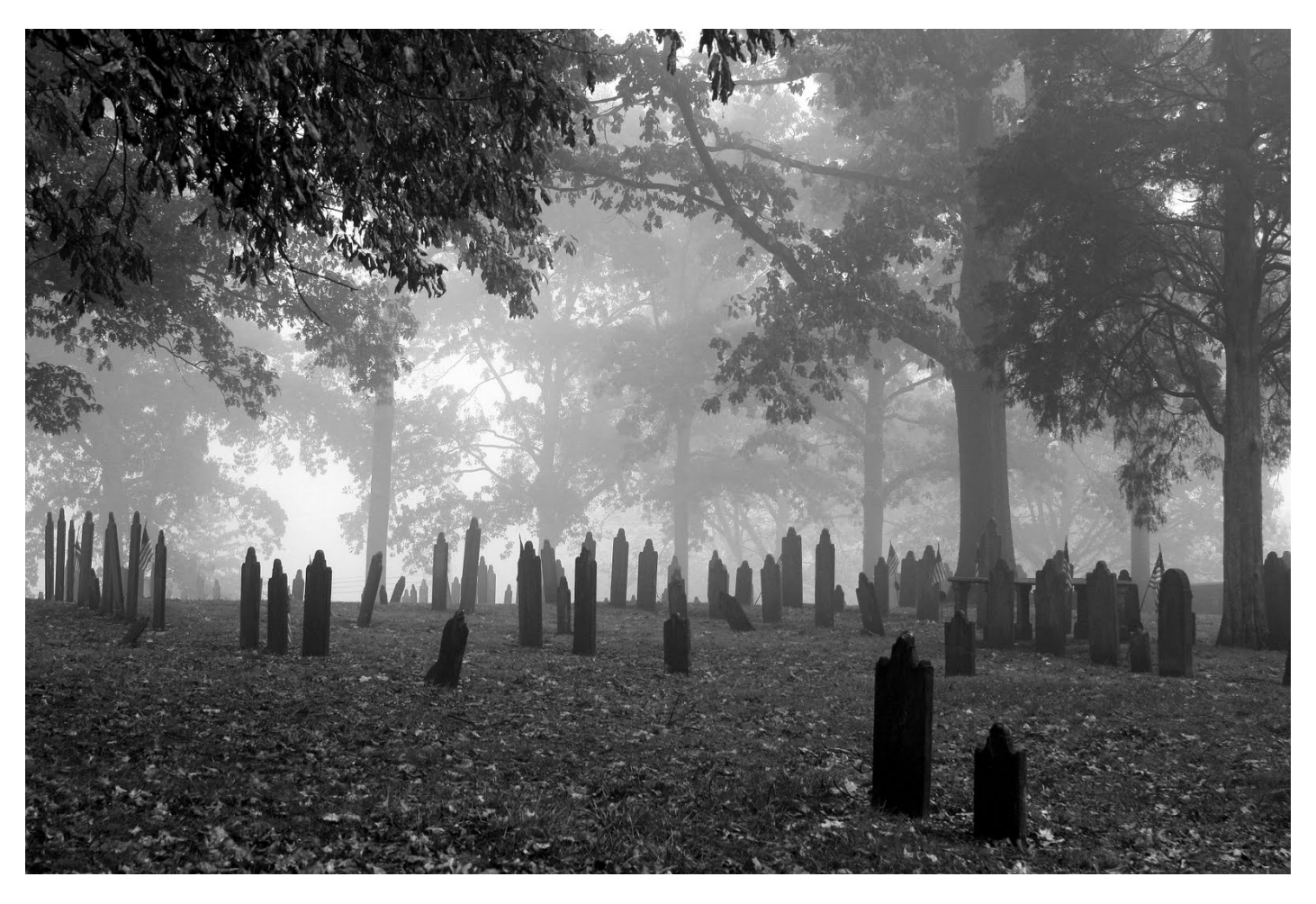
If the power of death is the devil's power and God does not inflict death as punishment for sin, then what do we do with texts like these?